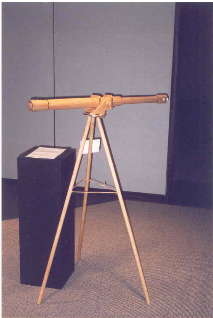
Replica of Galilean Telescope